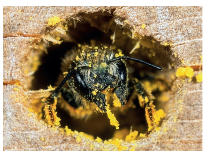
Through their performance, pollinators contribute up to eight percent to annual, global crop production (agricultural tonnage).