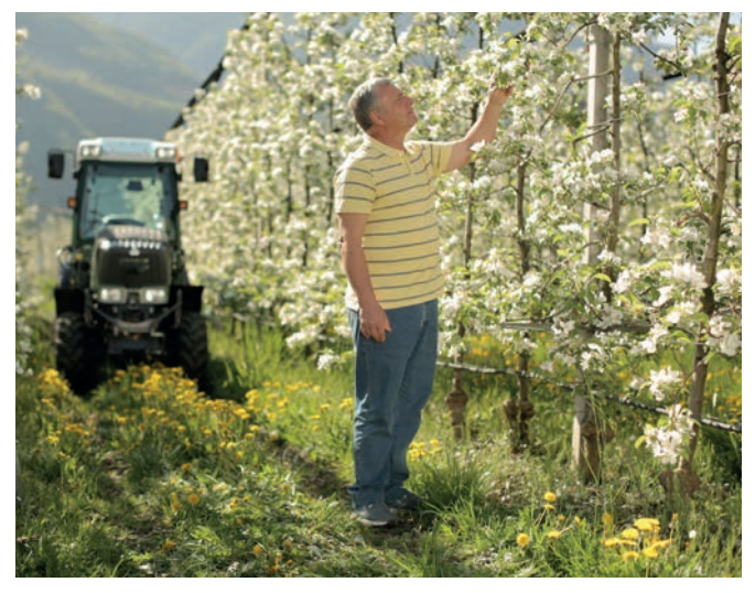
Bayer's Feed A Bee scientific activities, which are intertwined with its work on Sustainable Agriculture, explore ways to meet the needs of a diverse range of pollinator species, as well as the needs of farmers.