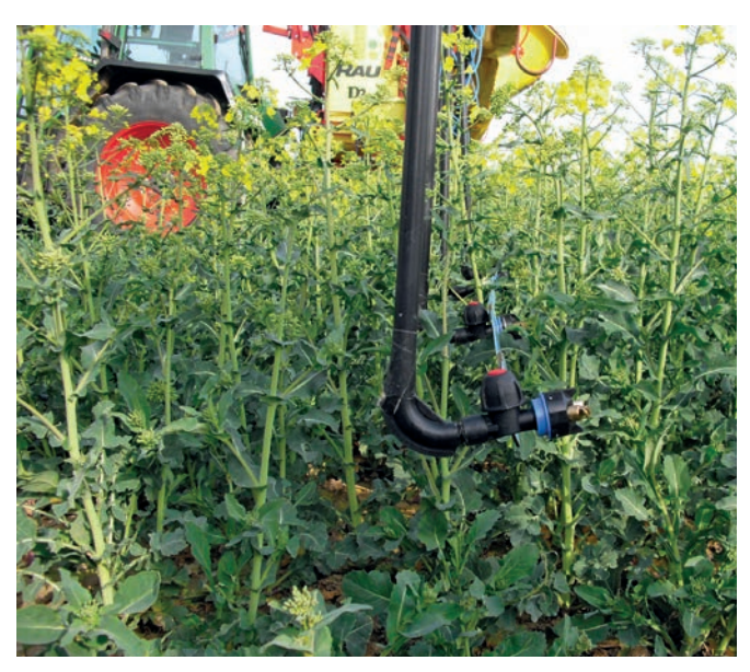
The 'Dropleg' application technology minimizes pollinators' exposure to pesticides when foraging on blossoms and reduces drift losses.

Given the close links between agriculture and pollination and the threats that certain agricultural practices pose to pollinators, there is a clear rationale for focusing pollinator protection and restoration efforts on agricultural land.<sup>21</sup> Indeed, some of the projects under the Sustainable Agriculture pillar look to optimize bee protection and crop protection at the same time, through innovative application technologies that reduce the exposure of bees and other pollinators to crop protection products.